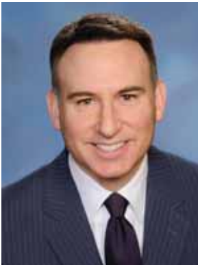
Dow Constantine King County Executive