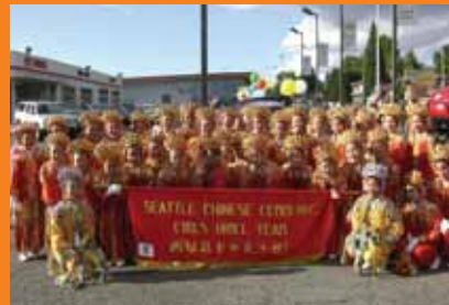
SEATTLE CHINESE COMMUNITY GIRLS DRILL TEAM

Now in its fifth decade, the Seattle Chinese Community Girls Drill Team continues to represent the Pacific Northwest, as a crowd-pleasing, award-winning, precision-marching unit.